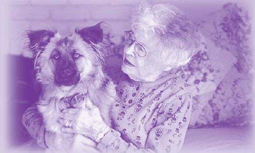
Promoting the protection of all animals

THE HUMANE SOCIETY OF THE UNITED STATES NORTHERN ROCKIES REGIONAL OFFICE 490 North 31st St., Suite 215 Billings, MT 59101