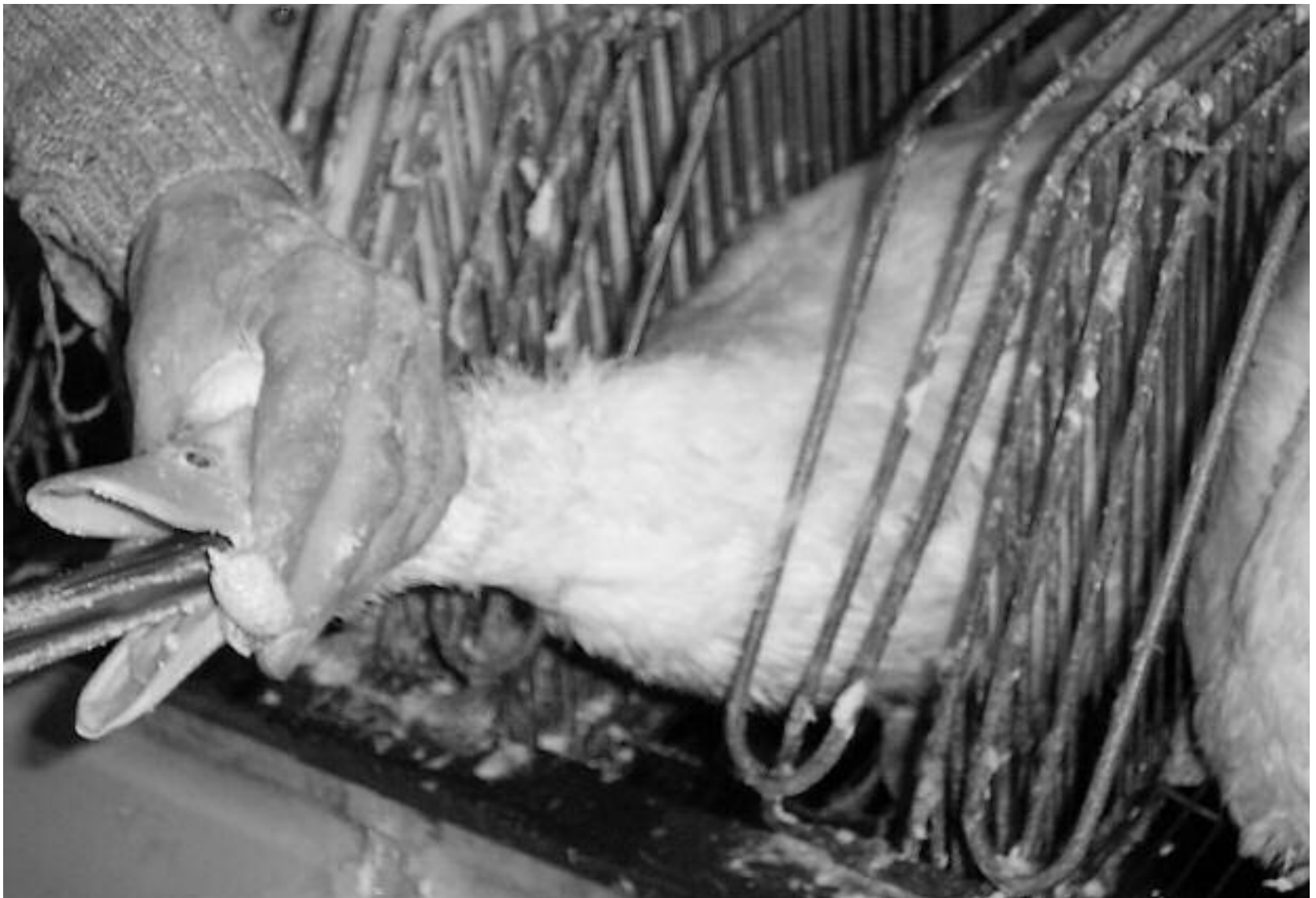
CITIZENS INITIATIVE FOR THE BANNING OF FORCE FEEDING

L AST YEAR, CHICAGO'S CITY COUNCIL BECAME A GLOBAL LEADER in the fight against cruelty when—by a vote of 48 to 1—it joined California and 15 countries in passing laws against foie gras. The vote showed that Chicagoans believe shoving pipes down birds' throats and force-feeding them until their livers expand more than 10 times their normal size is too inhumane to swallow.