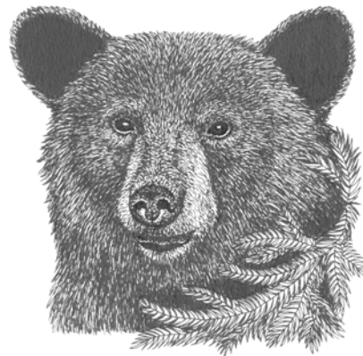
BLACK BEAR - SHANE DIMMICK

Zareba Systems 800/272-9877 www.zarebasystems.com