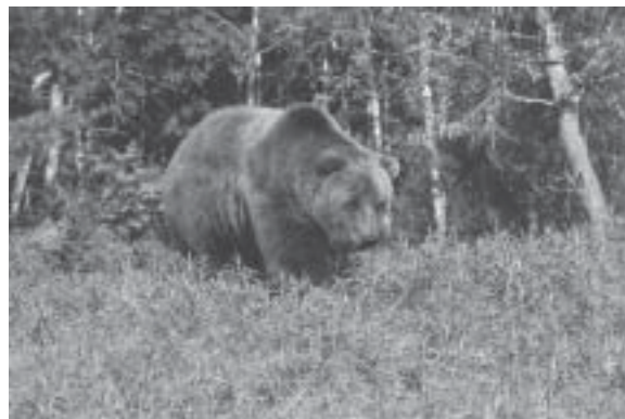
Notwithstanding the unacceptable cruelty involved in bear farming, there is no evidence whatsoever that bear farming has reduced the pressure on wild bear populations.

The world stood by idly in the 1970s and 1980s while the continent-wide population of African elephants was cut in half—from an estimated 1.3 million to