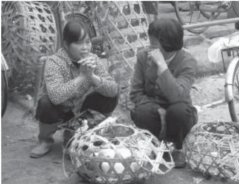
A high diversity of species in small areas, such as at this live bird market in China, increases the opportunity for pathogen transmission.

areas, it could be devastating to the avian species inhabiting those islands, many of which are already at risk.