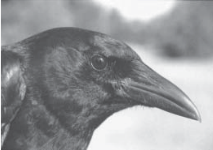
CAROLEE CAPREY WWW.AUDUBON.ORG/BBB/ANNV/