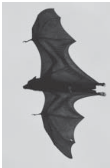
Increased intensification of pig farming adjacent to fruit bat colonies, along with other human-caused factors, may have contributed to the emergence of Nipah virus.

Understanding EIDs requires an understanding of the environmental changes that cause them to emerge and spread—changes in human behavior; travel of humans, wildlife, and domestic livestock around the