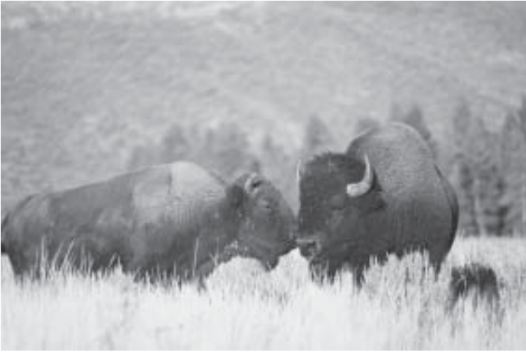
There have been no recorded cases of transmission of brucellosis—a disease originally transmitted to bison from livestock—from wild bison back into livestock; however, the perceived risk has led to conservation concerns for bison.

tionally for both the food and wildlife pet trades, has all the characteristics of a carrier of this disease: It is capable of being infected with the pathogen but suffers only minimal effects itself.