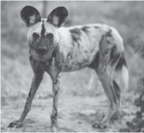
Research has shown that the disappearance of African wild dogs from the Serengeti that occurred in 1991 was caused by the transference of canine distemper and rabies in domestic dogs of that area to wild dogs.

world; agriculture and livestock production; and encroachment of human communities into wildlife habitat. The causal pathway by which these environmental changes may affect wildlife health, human health, and aspects of disease ecology (e.g., species extinctions and increased transmission of pathogens to humans) is under current investigation, but case studies can illustrate the close correlation between human-induced ecosystem changes and disease emergence.