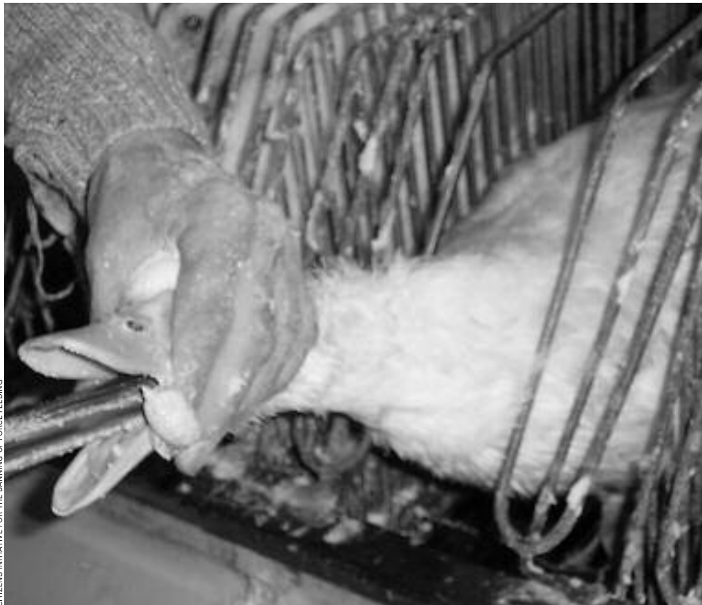
CITIZENS INITIATIVE FOR THE BANNING OF FORCE FEEDING

L AST YEAR, CHICAGO'S CITY COUNCIL BECAME A GLOBAL LEADER IN THE fight against cruelty when—by a vote of 48 to 1—it joined California and 15 countries in passing laws against foie gras. The vote showed that Chicagoans believe shoving pipes down birds' throats and force-feeding them until their livers expand more than 10 times their normal size is too inhumane to swallow.