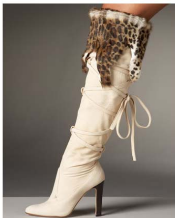
ZOOM | ENLARGE IMAGE

See our complete Manolo Blahnik collection.