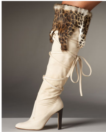
ZOOM | ENLARGE IMAGE

SHOE SALON: CATEGORIES: BOOTS & BOOTIES See our complete Manolo Blahnik collection.