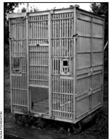
Figure 2. A typical laboratory cage for individually housed chimpanzees.

An analysis of chimpanzee research for the years 2000 to mid-2002 conducted by The HSUS revealed that information about the types of housing provided in publications or in federal grant abstracts was lacking (Conlee, Hoffeld, and Stephens 2004). Among 189 publications 24 percent mentioned social housing and 76 percent did not mention any specific housing type. Overall, information regarding the specific number of chimpanzees maintained in each type of housing (individual vs. social) was not readily available. Housing and environmental conditions, however, can have significant effects on research