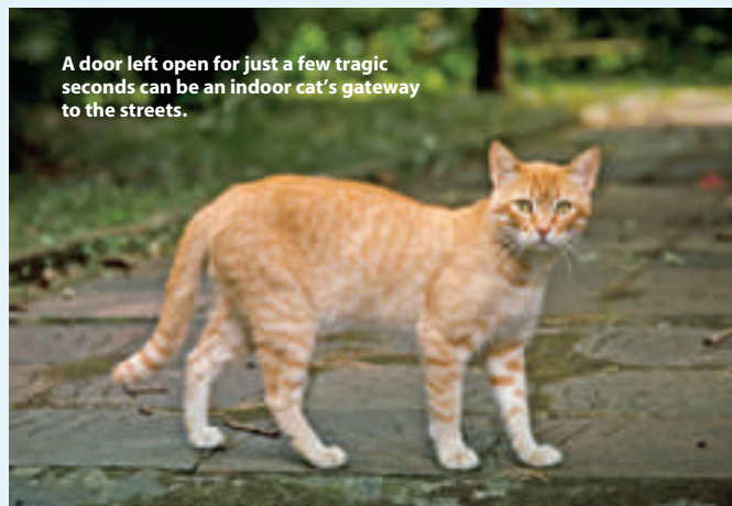
A door left open for just a few tragic seconds can be an indoor cat's gateway to the streets.

Subject to human whims and errors, the system can break down at several points. Many shelters now have universal scanners that can read microchips of different frequencies, but the serial numbers on the chips are often still untraceable—either because they have never been registered in the first place or because pet owners fail to update