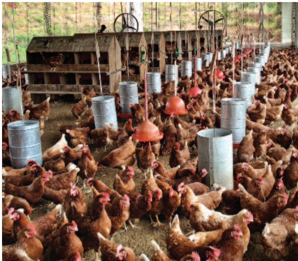
Hens are free from cages at this facility in Brazil, one of many countries where HSI works with local organizations to push for higher animal welfare standards.

As Western diets become increasingly popular in developing nations, factory-style agricultural practices are also proliferating. In India, more than 200 million hens confined in battery cages produce 80 percent of the country's eggs. But consumers still believe their eggs are "coming from some chicken running around in a village," says HSI campaigns manager Chetana Mirle.