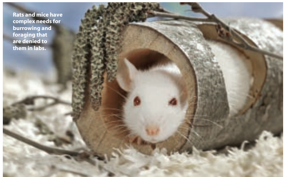
Rats and mice have complex needs for burrowing and foraging that are denied to them in labs.

Interpretation of the results also poses problems, Stephens notes. “Some animals are going to get cancer just because animals