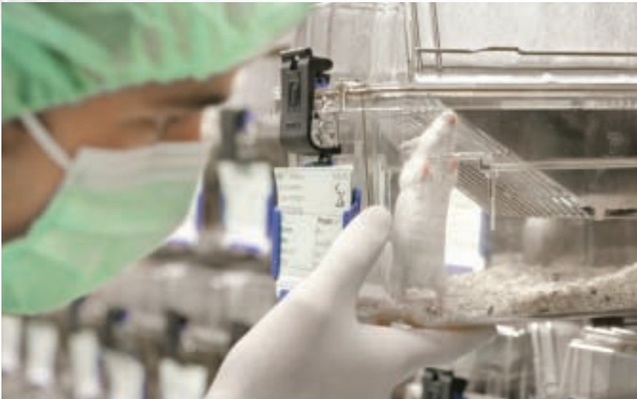
Most rodents in labs live alone in shoebox-size cages with nothing to do; experiments may leave them in near constant pain with no relief.

from a lab and put in an enclosed natural area revealed something different: They immediately began digging burrows, building nests, and creating their own society.