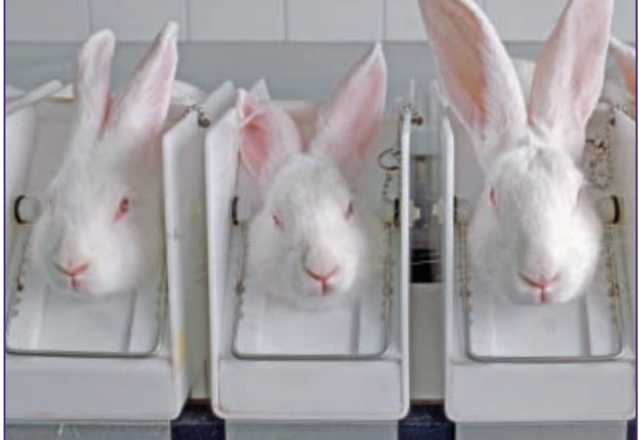
Full-body restraints hold rabbits during the application of a test substance to their eyes—in some cases, for more than 24 hours following the procedure.

With nearly 300 brands used by 3 billion people every day, Procter & Gamble is well-positioned to help drive change in the field. The company has spent more than $250 million over the past 22 years on alternatives, reducing its animal usage by 98 percent in that time, aiding in the development