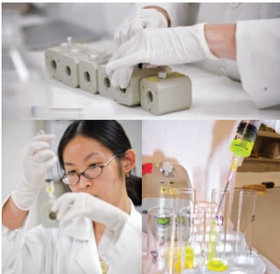
Workers at the Institute for In Vitro Sciences assess products for eye irritation using cow corneas left over from the meat industry and kept in cubelike chambers—a method preferable to using live animals. After a test substance is applied, the corneas are measured for opacity; the cloudier the cornea and the more the outermost tissues swell, the greater the irritation. A second test is performed using dye to measure the effects of irritation on the cornea's permeability. These precise assessments replace the subjective Draize test on rabbits, where researchers visually determine the level of irritation and assign a score.

In Europe, the push for alternatives has long been driven by cultural views on animal protection, as well as laws such as a 1986 requirement that nonanimal tests be used wherever available and a 2003 EU directive phasing in a ban on animal testing of cosmetics products and their raw ingredients. Even a large-scale EU chemical testing program has pushed corporations and governments to invest in nonanimal tests, says Stephens.