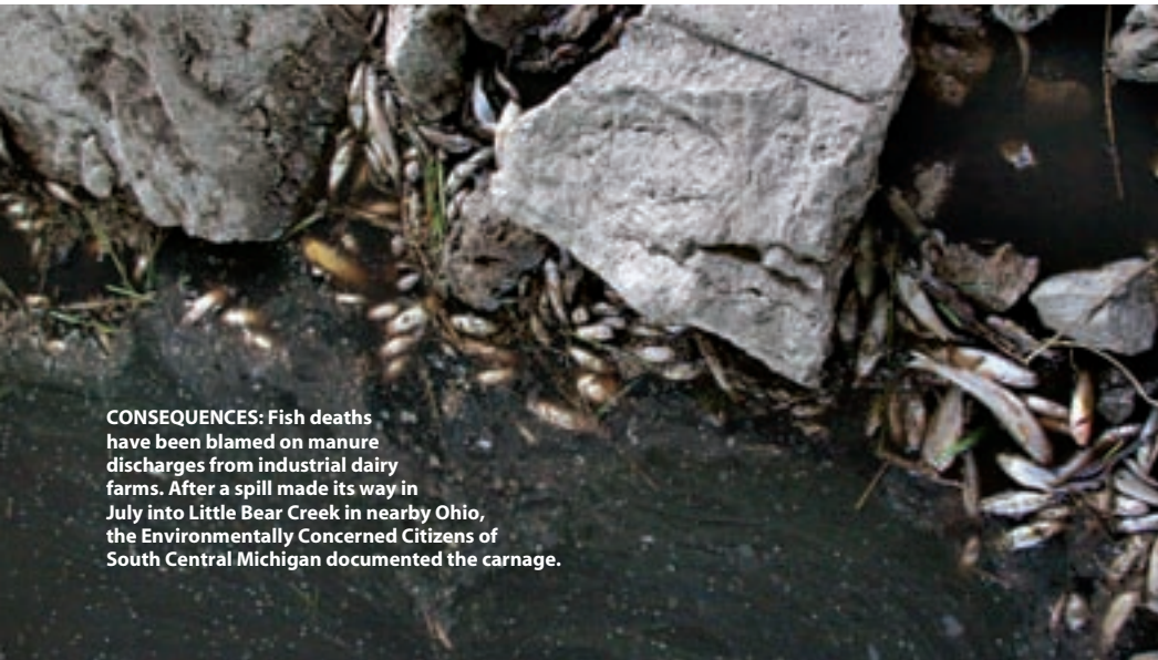
CONSEQUENCES: Fish deaths have been blamed on manure discharges from industrial dairy farms. After a spill made its way in July into Little Bear Creek in nearby Ohio, the Environmentally Concerned Citizens of South Central Michigan documented the carnage.