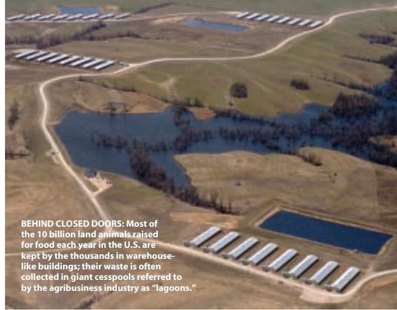
BEHIND CLOSED DOORS: Most of the 10 billion land animals raised for food each year in the U.S. are kept by the thousands in warehouse-like buildings; their waste is often collected in giant cesspools referred to by the agribusiness industry as "lagoons."

"There were pig bones everywhere. I had never seen a site like it," he says. "Leg bones, rib cages, and skulls. And there were bones at the edge of the lagoons, too." Speer also observed that the giant cesspools didn't have liners to help prevent the waste from seeping into groundwater or a fence to prevent wild animals and free-