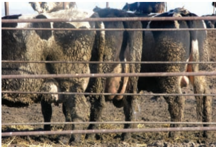
WALLOWING IN WASTE: These cows raised for milk are caked in manure. According to EPA estimates, the amount of raw waste produced by confined farm animals in the U.S. is three times greater than that generated by humans. The resulting air and water pollution damages the environment and destroys local communities—something The HSUS’s Animal Protection Litigation section is fighting in the nation’s courts.

The following pages profile people working to take back their communities in three other states—one where a couple gained a million-dollar judgment against a pig facility, another where The HSUS has taken on a legal battle against an egg operation, and a third where a statewide legislative fight against factory farms has just begun.