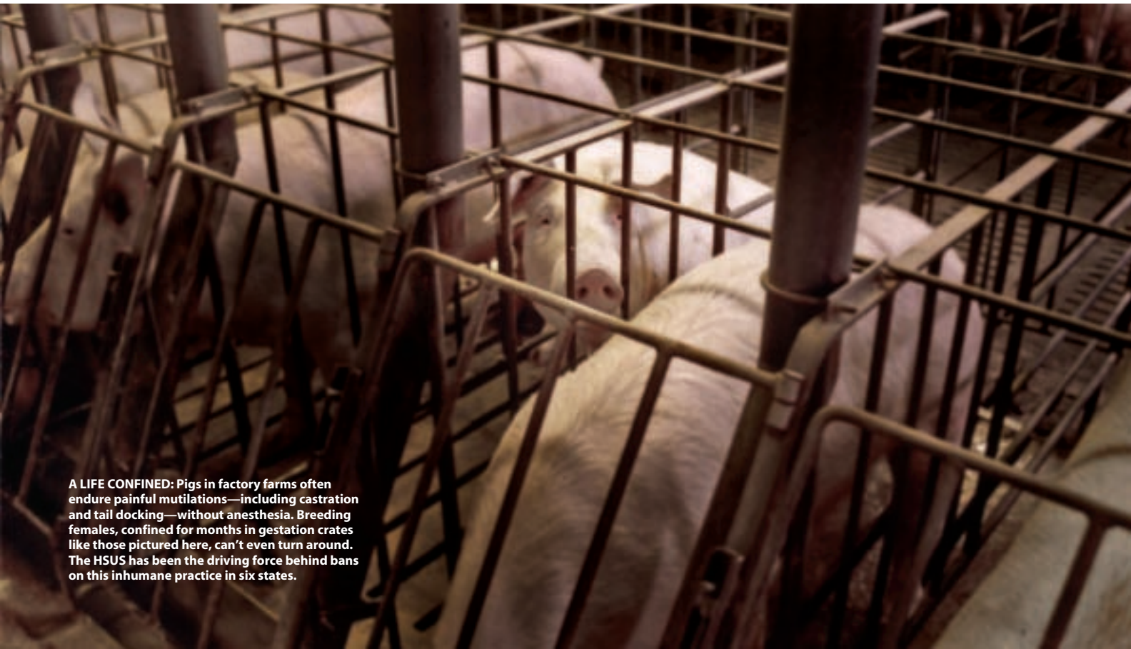
A LIFE CONFINED: Pigs in factory farms often endure painful mutilations—including castration and tail docking—without anesthesia. Breeding females, confined for months in gestation crates like those pictured here, can't even turn around. The HSUS has been the driving force behind bans on this inhumane practice in six states.