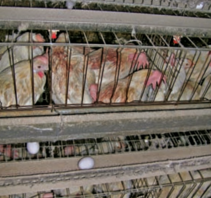
TRUE COSTS: Egg-laying hens in battery cages each live in a space no larger than a sheet of paper. A recent voter-led ban on such extreme forms of confinement will help millions of chickens in California, adding momentum to the fight for improved treatment of farm animals nationwide.

Factory farms present such grave threats to animals, the environment, and public health that the U.N. Food and Agriculture Organization, the Pew Commission on Industrial Farm Animal Production, and the American Public Health Association have all detailed their harmful impacts. Yet these large-scale operations, often buoyed by industry-friendly “right-to-farm” laws in their states, still enjoy scant oversight.