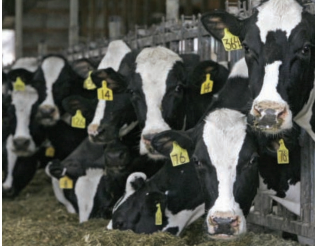
MILK MACHINES: Once their productivity wanes, weakened dairy cows are typically sent to slaughter. Their male offspring often end up in veal facilities, where they are virtually immobilized in small crates. Michiganians for Humane Farms—a committee set up by The HSUS—is laying the groundwork for a 2010 ballot initiative that would outlaw such confinement.

"This would give nearly all the power of determining animal welfare standards directly to pork, veal, milk, and egg producers,"