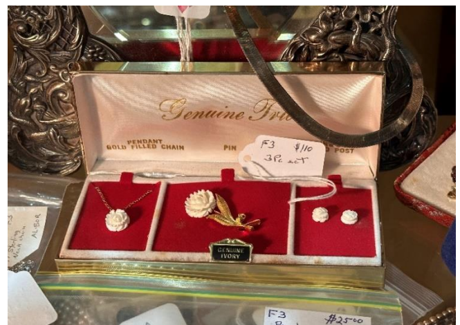
Pendant, pin and earrings labeled as genuine ivory.