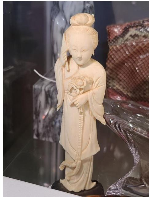
Figurine likely made from ivory.

Each year, as many as 15,000 elephants are killed in Africa to supply the demand for ivory. A recent report found the population of savanna elephants has declined by 60%, and forest elephants by more than 86%, since the 1970s, placing them closer to extinction.