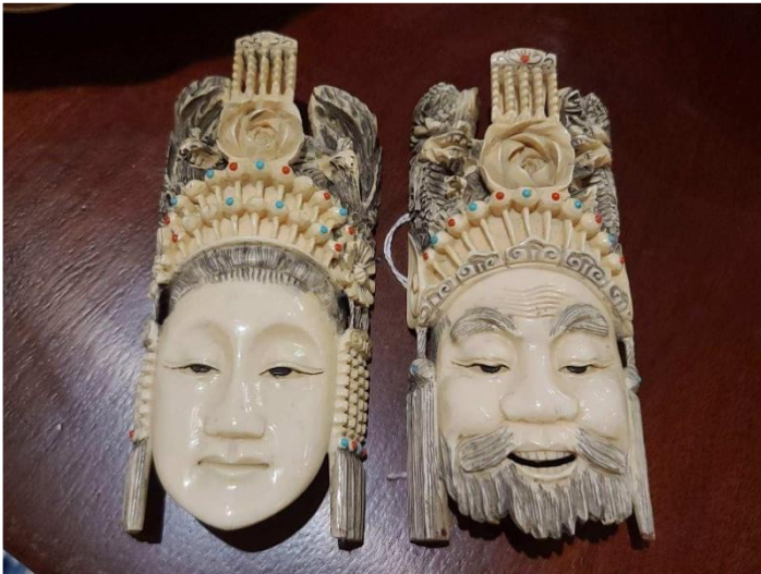
Undocumented belt charms suspected to be ivory.

Undercover investigation underscores the need for a state law to combat trade in elephant ivory