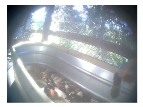
Dead and dying guinea pigs were found almost daily in overheated, poorly ventilated and overcrowded metal tubs. Sick guinea pigs were killed by being slammed to the ground repeatedly.