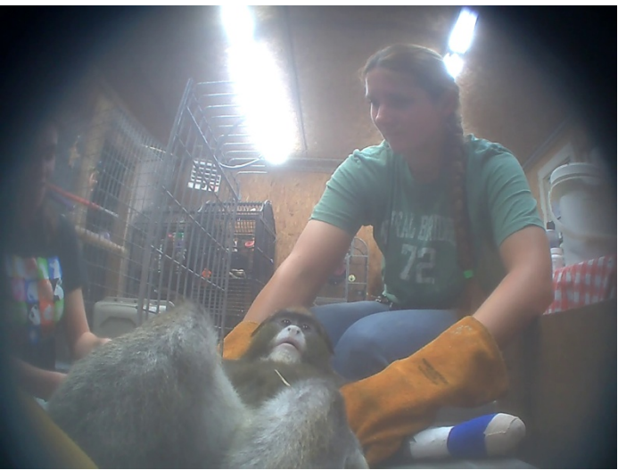
This DeBrazza monkey sliced open his hand, apparently on a broken rusty pipe. He was violently jabbed with sticks to remove him from a pet carrier, sedated and restrained multiple times while his bandages were cut off with a dull scissors and replaced. During one treatment, he began jerking uncontrollably and appeared to have a fever, but no one took his temperature or called a veterinarian.

This spider monkey, who was apparently captured in Guatemala as an infant, was isolated in a barren cage in a filthy, cockroachinfested barn because an injury on her hand became badly infected (inset) after it was ignored for weeks. When it was finally treated, she was subjected to the stress of sedation, capture, restraint and wound treatment for more than a month. Despite being in severe pain, she was never once given painkillers.