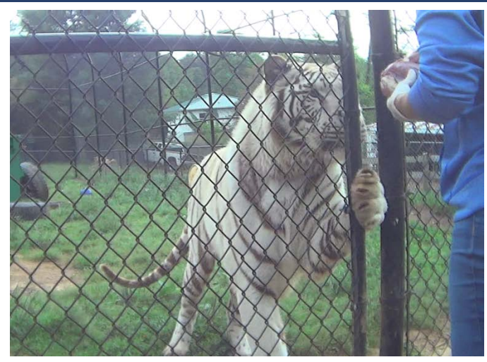
A tiger is able to fit his paw through a gap in the enclosure.

Cages and safety barriers at NBZ are poorly designed, putting animals and the public at risk. Additionally, there are no safety protocols to protect staff from animal diseases or to address emergencies such as an attack or escape.