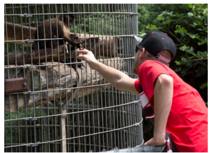
Visitors are able to reach across inadequate safety barriers and touch capuchin monkeys and gibbons.