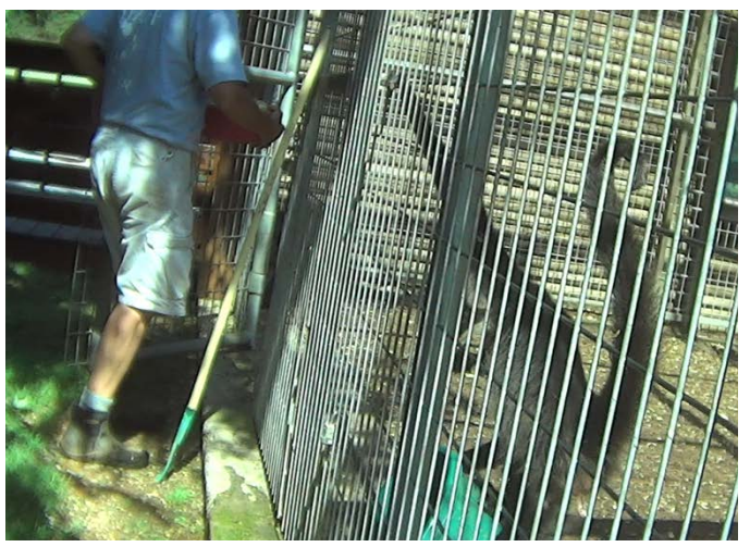
In many cages, animals have an opportunity to escape every time their cage door opens.