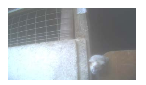
Tori, a baby camel, suffered a traumatic death by hanging after her neck became wedged in a gap between the gate and the wall.