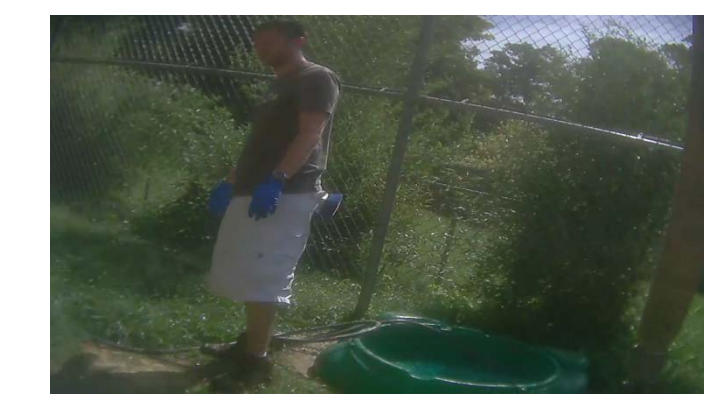
An untrained keeper is cleaning the macaque cage wearing only gloves and no face mask, eye shields or other protective gear, despite the danger of contracting the deadly Herpes B virus from macaques. At professionally run zoos, keepers wear biohazard safety suits when working around many primate species.