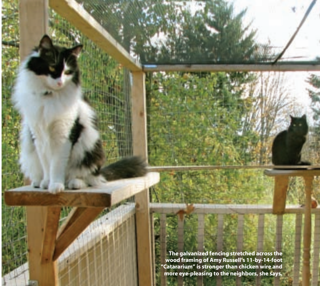
The galvanized fencing stretched across the wood framing of Amy Russell's 11-by-14-foot "Catararium" is stronger than chicken wire and more eye-pleasing to the neighbors, she says.

Other vendors of kitty jungle gyms, perches, and containment systems: cagesbydesign.com catsondeck.com kittywalk.com wildwhiskers.com catsplay.com katwalks.com therefinedfeline.com