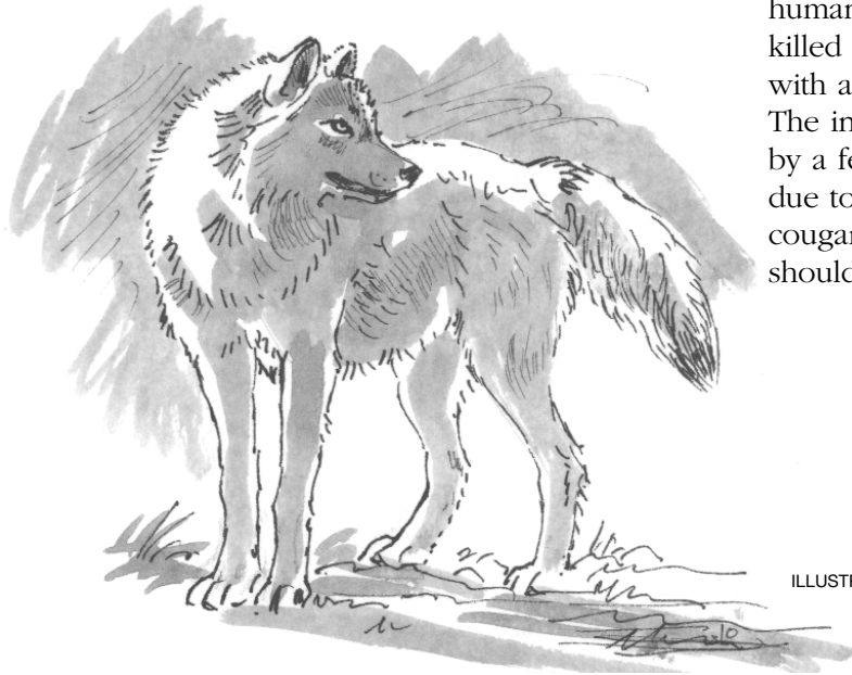
ILLUSTRATIONS BY JOAN OUELLETTE